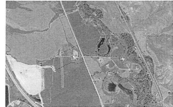
Location Map (NTS)